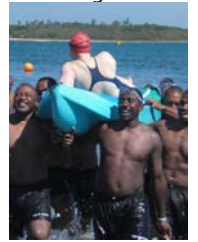
Completing the 2km swim anyway you can!

13 teams of Accor employees competed in the Race to Survive, which involved four days of intensive physical effort - including running, cycling, swimming, kayaking and outriggering. The teams were made up of 12 international teams from Australia, New Zealand and Thailand, as well as a local Fijian team. Each team of five also included a Fijian staff member from Sofitel Fiji Resort & Spa, Novotel Nadi, Mercure Hotel Nadi and Tradewinds Hotel and Convention Centre Suva.