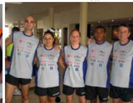
Against All Odds