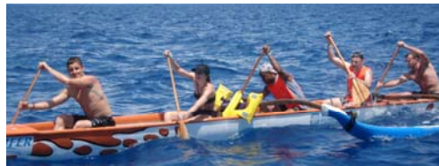
Outriggering to Vomo