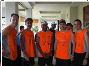
Team Tao Thailand