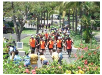
Teams crossing the finish line

The 2008 Accor Race to Survive to Cure Kids raised more than $FJ310,000 for Cure Kids Fiji, for vital medical equipment and supplies for Fijian hospitals, improving on the generous amount raised in the inaugural 2006 race.