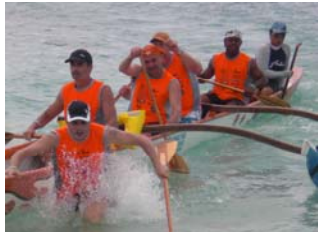
Outrigger race on Vomo