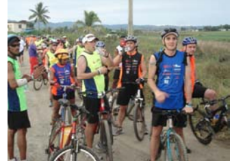
A break in the cycle leg