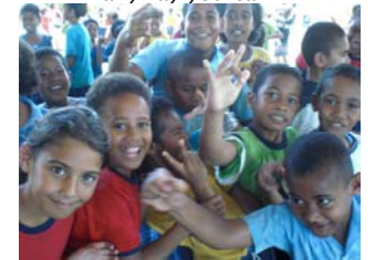
Kids greeting at the finish line

Prior to the race all the competitors visited Lautoka Hospital to witness first hand how the money they raised was being spent and the significant difference it is making, and will continue to make, for young Fijian children.