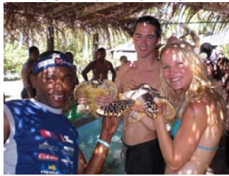
Turtle time on Vomo

Prior to the race all the competitors visited Lautoka Hospital to witness first hand how the money they raised was being spent and the significant difference it is making, and will continue to make, for young Fijian children.