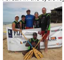
Team Trinity outrigger victory