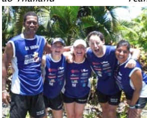
Sa Yawa II