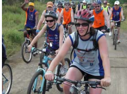
This is not like a spin class!