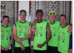
Crash & Burn