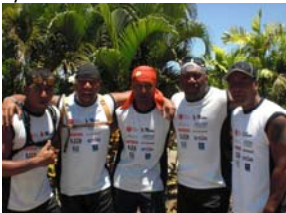
Team Kai Viti