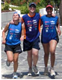
8.5km run finish line

13 teams of Accor employees competed in the Race to Survive, which involved four days of intensive physical effort - including running, cycling, swimming, kayaking and outriggering. The teams were made up of 12 international teams from Australia, New Zealand and Thailand, as well as a local Fijian team. Each team of five also included a Fijian staff member from Sofitel Fiji Resort & Spa, Novotel Nadi, Mercure Hotel Nadi and Tradewinds Hotel and Convention Centre Suva.